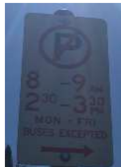
No Parking on a school Day

duty of care to protect our children, please adhere to the no parking dates and times listed on these signs.